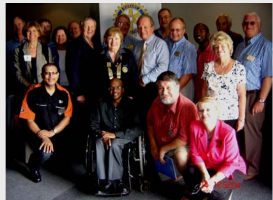
DG Beth (D9300) and seminar participants

It's never been done before It'll never work We don't do that kind of thing in our organisation Not that again It's too radical It has been like that for 15 years Nothing will ever change it It will cost too much It is not my responsibility Let's talk about something else It is impossible We tried that once before Yes we do, but not right now.