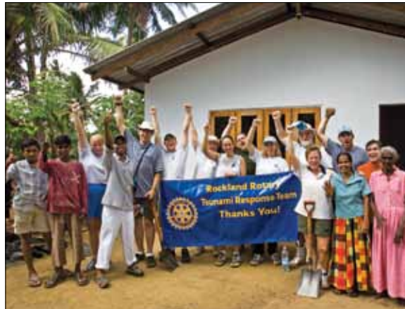
When the December 2004 tsunami struck Sri Lanka, the Rotary Club of Rockland, Maine, USA, led a collaborative project with Habitat for Humanity to help repair and rebuild homes along the country's devastated coastline.

"We could just see houses sliding down the hill," recalls Beyl. "And, of course, it affected the poorest people because they lived in areas of higher risk, on the side of the mountains."