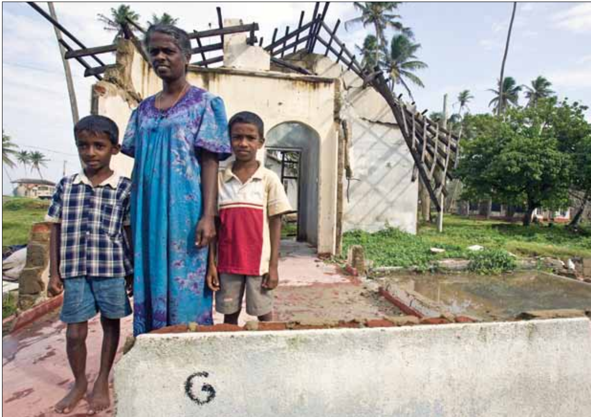
A Sri Lankan mother and her sons stand in front of the remains of their home, destroyed during the 2004 tsunami.