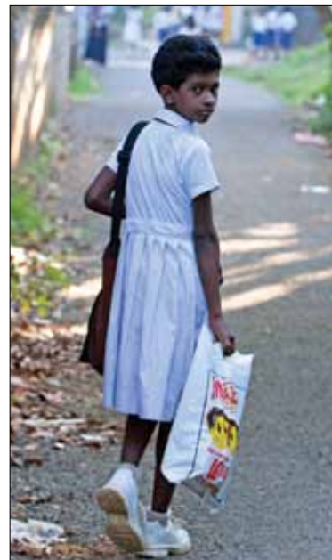
A Sri Lankan student arrives at one of 22 schools that Rotarians helped rebuild in response to the 2004 tsunami.