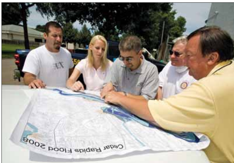
Members of the Rotary Club of Cedar Rapids, Iowa, USA, review a map of the damage to their community after a 2008 flood.

When Cyclone Sidr struck Bangladesh in 2007, the country's then 152 Rotary clubs provided immediate relief in any way they could, distributing everything from water to blankets in hard-to-reach coastal areas. But even as they met short-term needs, Rotarians were